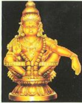
Sri Dharma Sastha