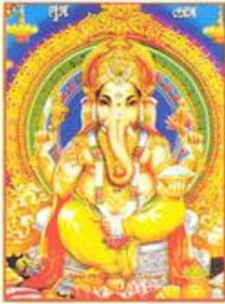
Sri Maha Ganapathi

Venue : Hindu Sadara Kshemabhivridhi Sangha (Formerly Sadara Vidya Abhivrudhi Sangha) No.5-A, 4th Main, 'A" Road (Near G.D.Naidu Hall), West of Chord Road, 2nd Stage, Mahalakshmpura Bangalore - 560 086. (Phone: 23490073)