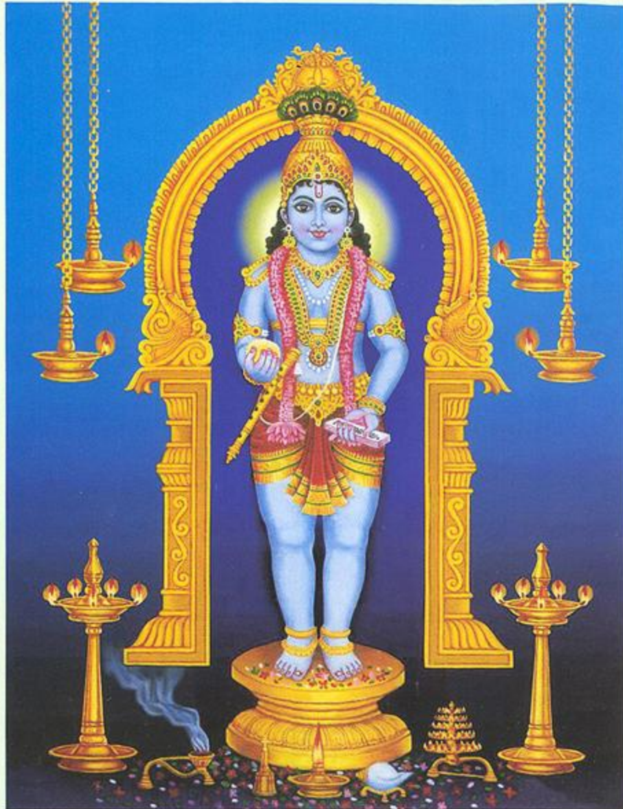
SRI GURUVAYURAPPAN - VAKACHARTHU